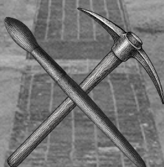
Image: Interior Yallourn

CONTACT: OPENCUTCOLLECTIVE.COM | CREATE@OPENCUTCOLLECTIVE.COM